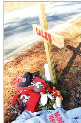
A memorial on Fairplay Road, near the site of the accident, was set up following the death of 18-year-old Caleb Sorohan. Various items were added as the week progressed.