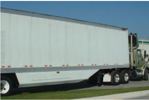
Figure 3.4 Example of Freight Vehicle Aerodynamic Improvements