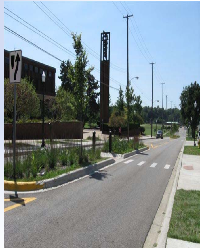
University Avenue Project